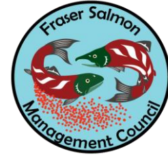
Fraser Salmon Management Council (2014)