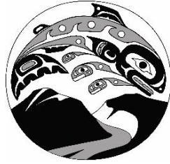
Fraser River Aboriginal Fisheries Secretariat (1994)