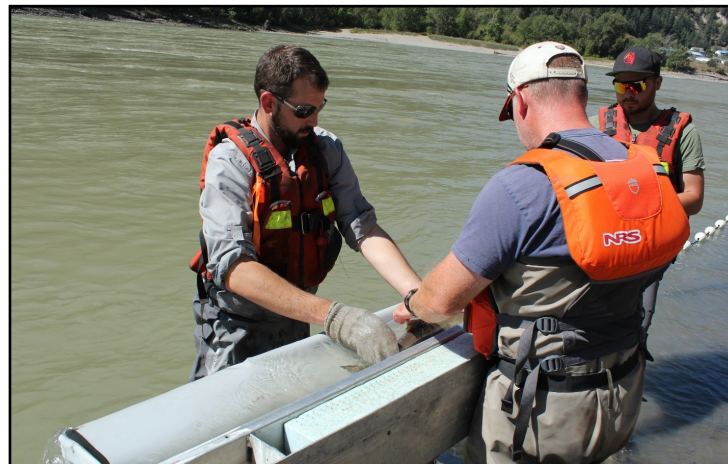
Radio tags data is utilized to inform the environmental unit on the passage rate of fish, and the rates of successful migration past the different fixed points of the receivers.