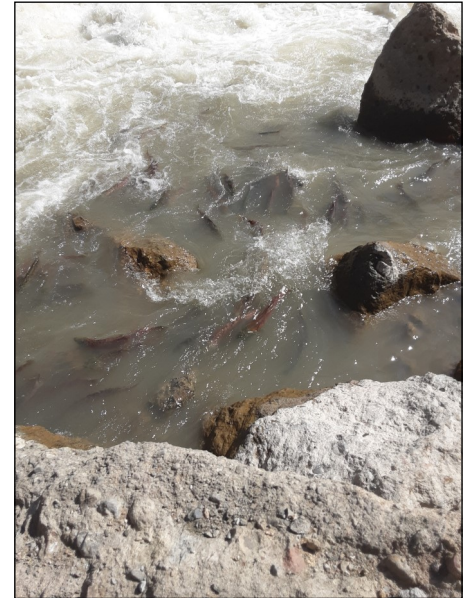
Salmon work their way upstream.