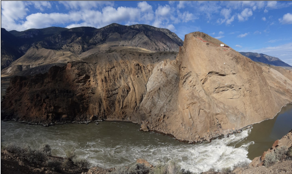
Rock scalars continue their work to restore passage through the landslide.