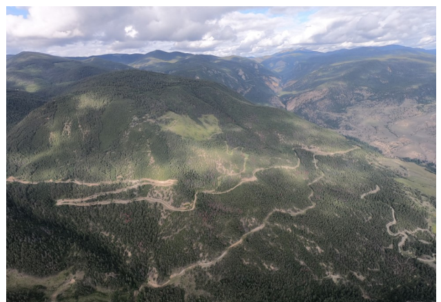
The network of roads adjacent to the slide site.