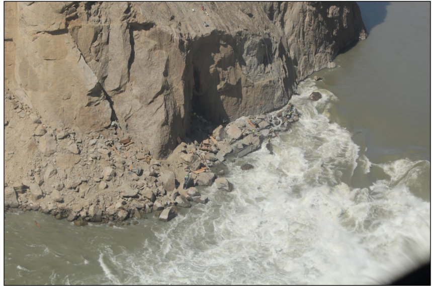
Rock scalers have further opened the passageway. Sockeye salmon are now successfully making their way past the slide.