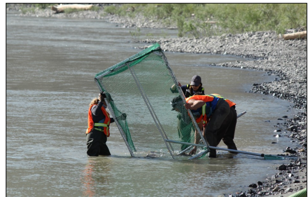
Crews continue fishing efforts to move salmon upstream by helicopter. More than 50,000 fish have been transported to date.