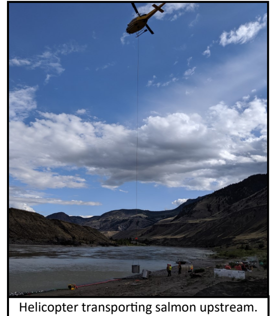
Helicopter transporting salmon upstream.