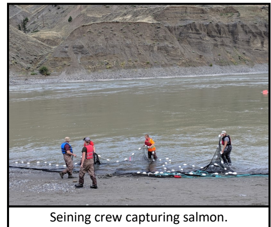
Seining crew capturing salmon.