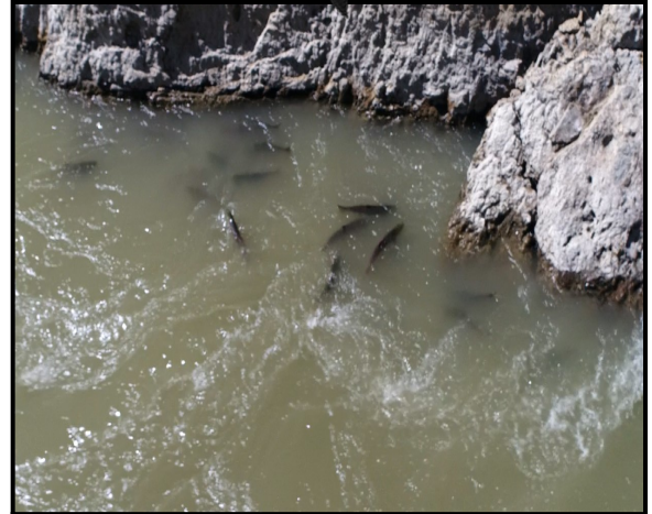
Salmon pooling above the landslide.