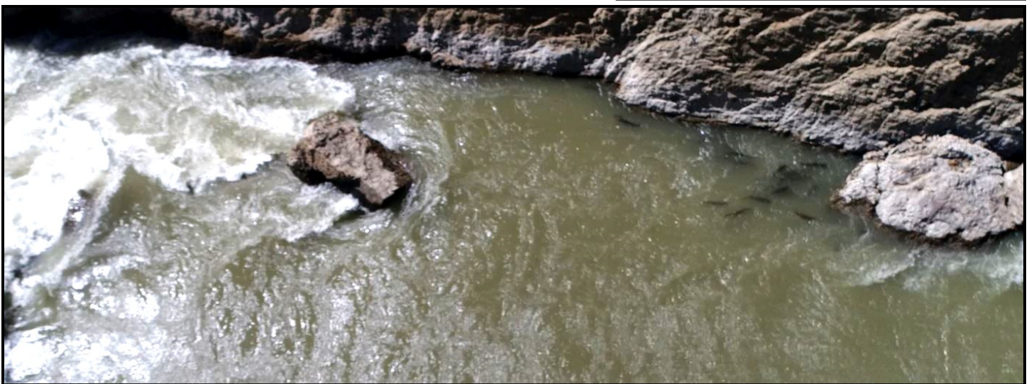
Salmon that have migrated past the landslide.