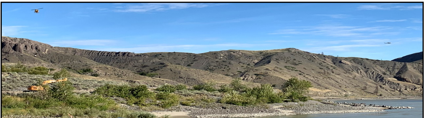
This image shows an excavator used for road construction and two helicopters conducting salmon transport operations.