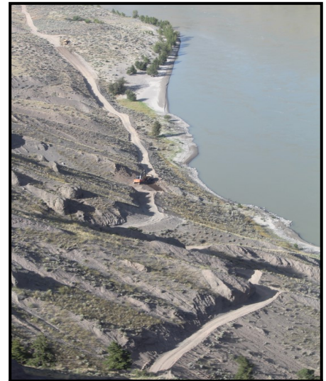
Road construction progress.