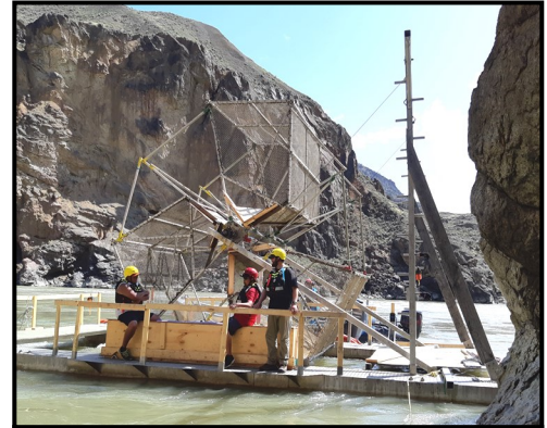
The fish wheel capturing salmon.