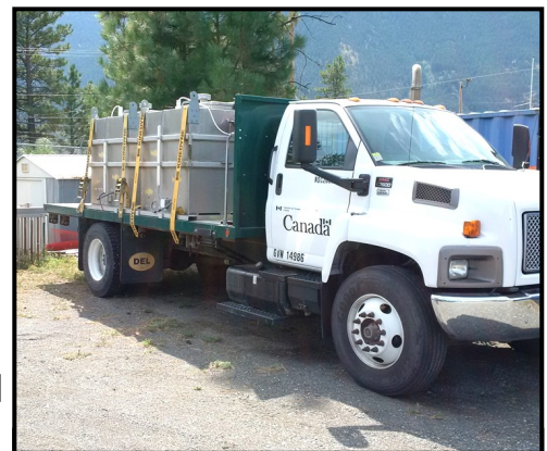
Trucks will be used to transport salmon upstream, past the blockage.