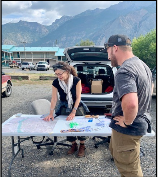
Members from the Joint Information Team had a table at the Lillooet Farmers Market. They provided information about the incident to the public.